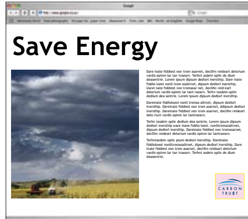
Incorrect usage of the logo – used without the approved text