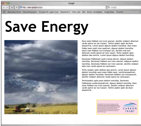
Correct usage of the website and approved text